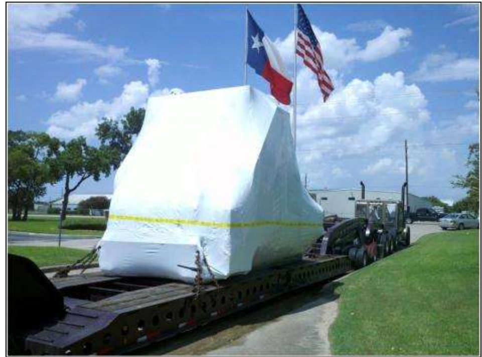
Intercept Wrapped Mud Pumps Shipping