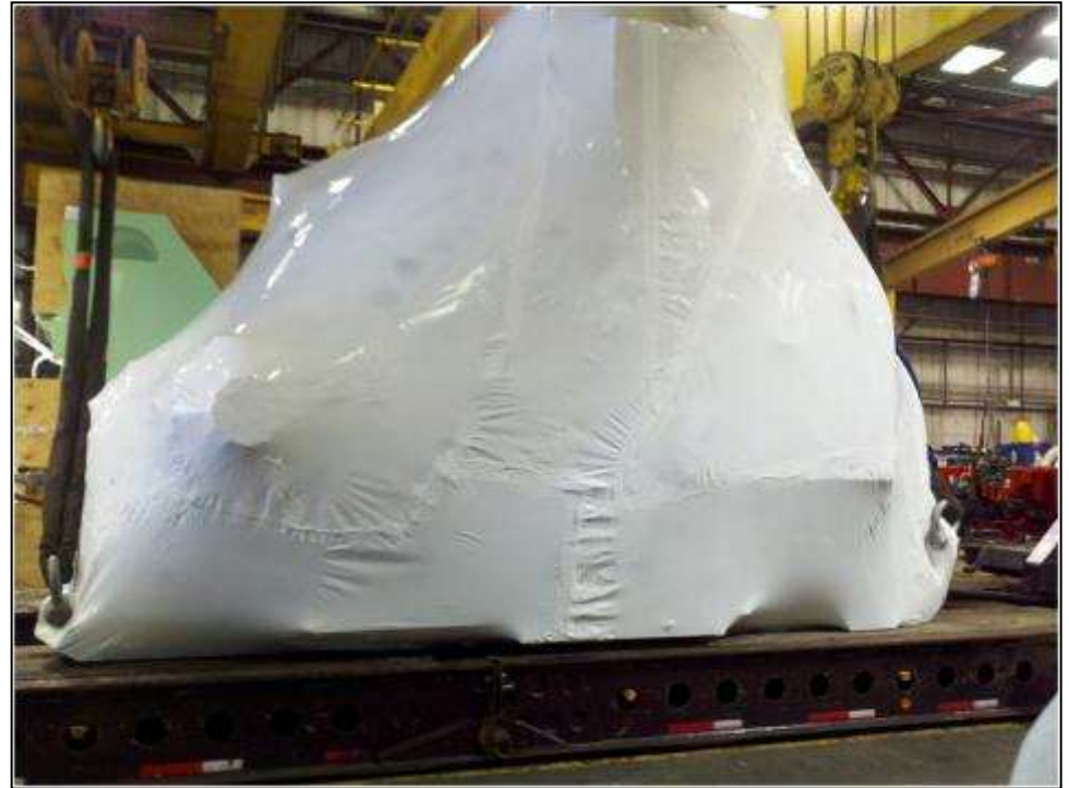
Mud Pump Wrapped And Loaded Onto A Flatbed