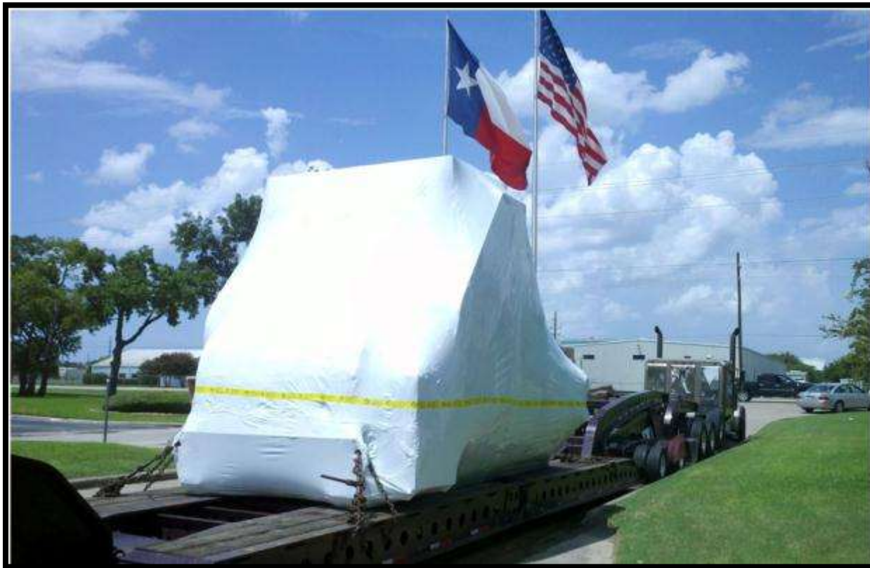
Finished Wrapped Mud Pump